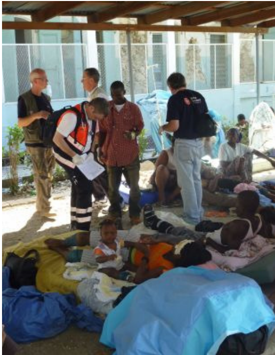
In the hospital „Francois de Sales“ the Malteser team has been starting its medical work.